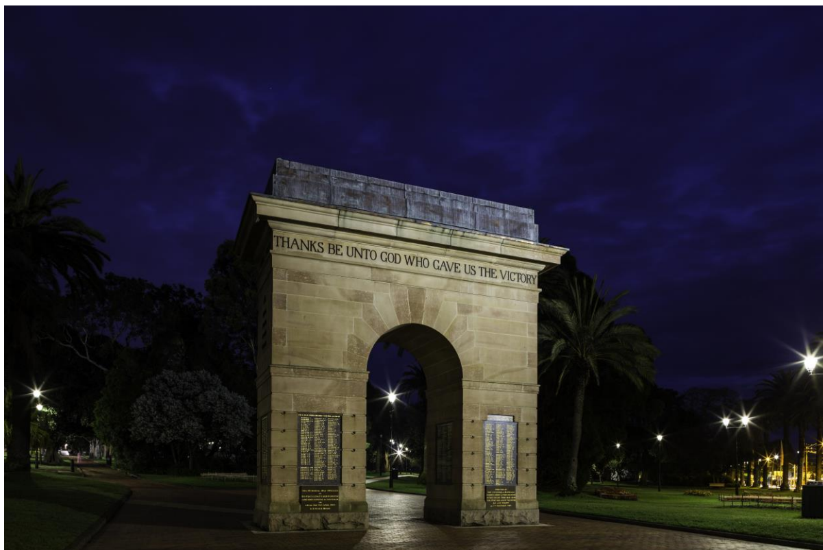
Burwood War Memorial Arch