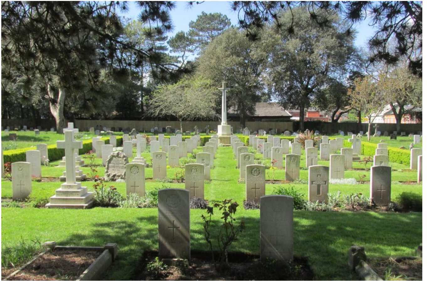
Bournemouth East Cemetery